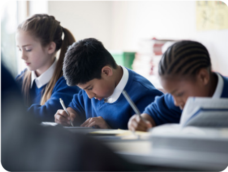
Education, early years and childcare

Any professional working with a family, such as schools, health services and voluntary sector organisations, can offer early help services as soon as they can see that advice or support may be needed.