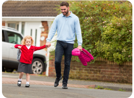
Family support, parenting and parental conflict