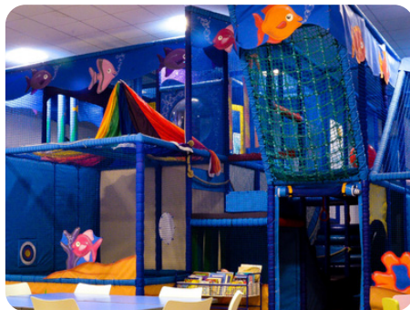
Warrington Play and Sensory Centre

If the problem hasn't been resolved and further support is needed, our early help teams are here to support you.