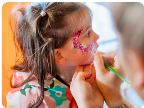
Children's centres and Family hubs