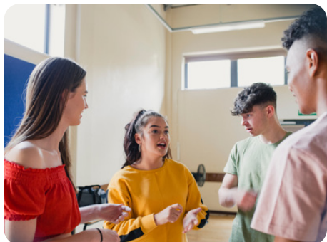
Warrington Youth Service